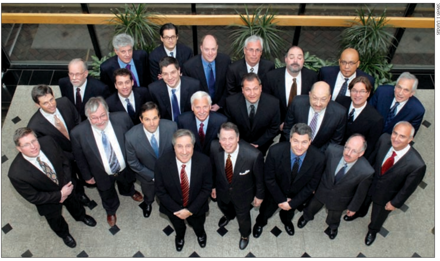
Lerner David's 60 attorneys solve your intellectual property problems in the context of your business goals.

OFFERING EXPERTISE IN INTELLECTUAL PROPERTY SINCE 1969